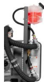
Heat Exchanger option