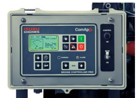
ComAp 'PRO' Controller