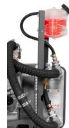
Heat Exchanger option