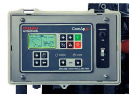
ComAp 'PRO' Controller