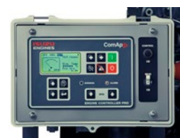
ComAp 'PRO' Controller

ComAp 'PRO' professional engine controller (advanced engine monitoring protection, plus customer application inputs/outputs, complete event history log, large easy to read display)