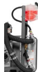
Heat Exchanger option