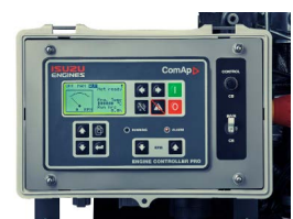
ComAp 'PRO' Controller