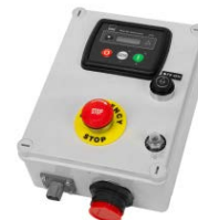
DeepSea 'ECO' Controller